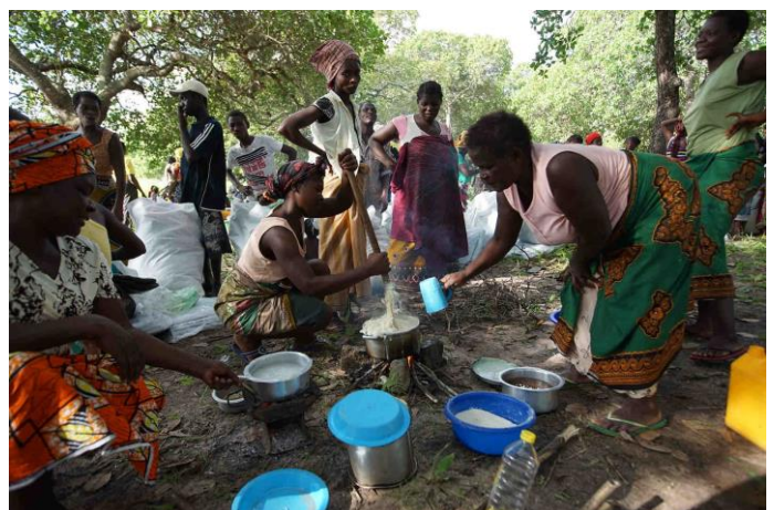
Accommodation center in Cajual, Mocuba: Women at the camp cooking.