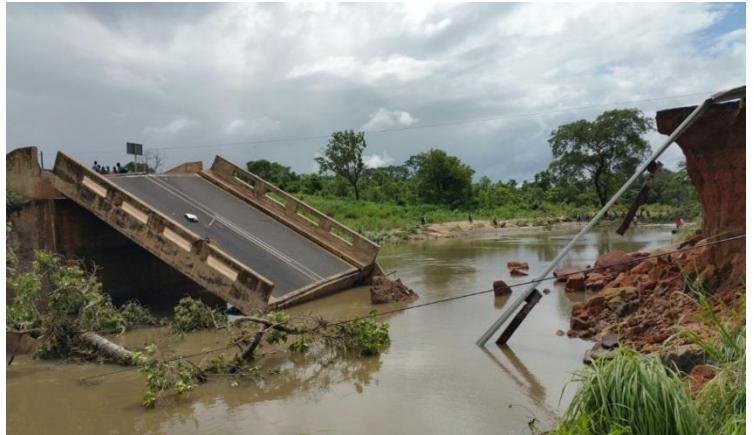
Bridge over Namilate River, 58km from Mocuba

The government leads the coordination of the current emergency response and the coordination meetings are carried out daily in Zambézia and Nampula province. At central level, the Technical Council for Disaster Management (CTGC) also meets at least twice a week to monitor the hydrometeorology situation, the occurrences and the level of response to the emergency in the affected provinces. After the declaration of the Red Institutional Alert on 12 January 2015, the National Emergency Operation Centre (CENOE) at central and regional levels and the Emergency Operative Centre (COE) at provincial level as well as the National Civil Protection Unit (UNAPROC) are fully operational, updating the information from the accommodation centers, adjusting the response planning and assisting in the transport of goods, medicines and people.