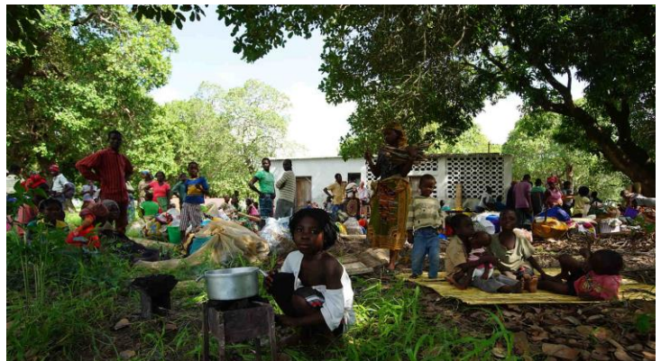
Accommodation center in Cajual, Mocuba. A young displaced girl with family, cooking.