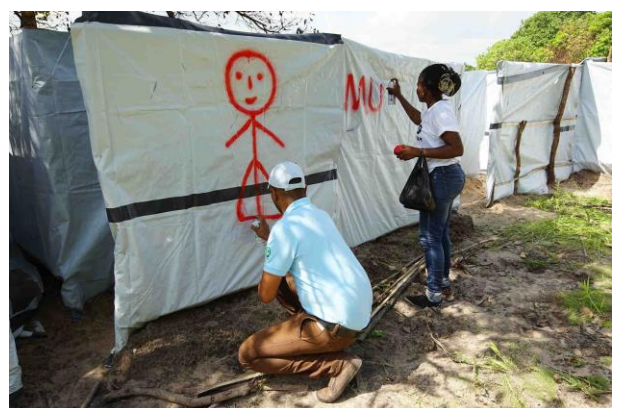
Accommodation center in Cajual, Mocuba. Latrine construction.