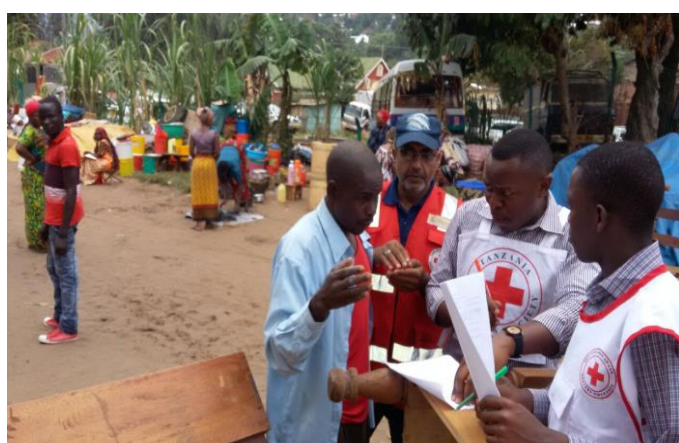
The Tanzania Red Cross Society Kagera Branch Volunteers doing initial assessment of the earthquake impacts in Bukoba, Kagera region.

According to the USGS hazard analysis , it is estimated that the earthquake will mainly have strong impact on Bukoba, Katerero and Kyaka and that these areas in the yellow category of estimated fatalities (see figure on estimated fatalities below). 1 The impact can be based on the fact that the majority of the population in this region resides in structures that are vulnerable to earthquakes, though some earthquake resistant structures exist.