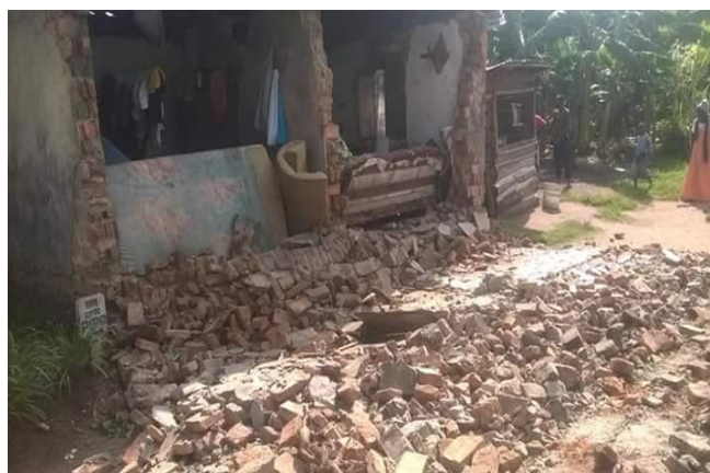
A 5.7 magnitude earthquake has caused widespread devastation in the worst-hit city of Bukoba. Red Cross volunteers are assisting by providing care and aid to those affected by the quake.

According to the USGS hazard analysis , it is estimated that the earthquake will mainly have strong impact on Bukoba, Katerero and Kyaka and that these areas in the yellow category of estimated fatalities (see figure on estimated fatalities below). 1 The impact can be based on the fact that the majority of the population in this region resides in structures that are vulnerable to earthquakes, though some earthquake resistant structures exist.